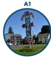
A1 6 Montcalm St. Circle Court Motel