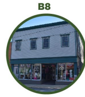
B8 106 Montcalm St. Mixed-Use Building