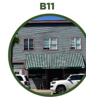
B11 109 Montcalm St. Ticonderoga Natural Foods Co-op