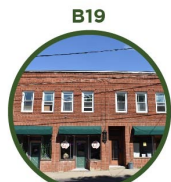
B19 172 Champlain Avenue Mixed-Use Building