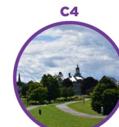
C4 Bicentennial Park Improvements