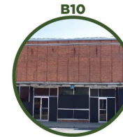
B10 108 Montcalm St. Building Rehabilitation