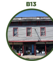
B13 113 Montcalm St. Punky Noodles Children's Museum/ Champ Café / Daycare