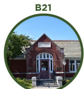
B21 6 Carnegie Place Black Watch Library