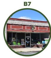
B7 105 Montcalm St. Sports & Entertainment Venue