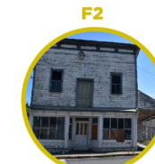
F2 74 Montcalm St. Demo of Agway Building