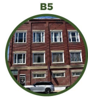
B5 103 Montcalm St. Adirondack Performing Arts Center