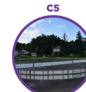
C5 Tower Ave. & Burgoyne Ave. Capital Ice Rink Improvements