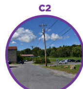
C2 Adirondack Dr. Improvements