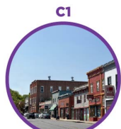
C1 Montcalm St. Streetscape Improvements