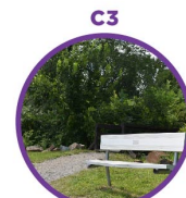
C3 Riverfront Recreation Improvements