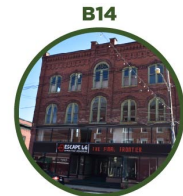
B14 116 Montcalm Street The Perelman Boutique Hotel